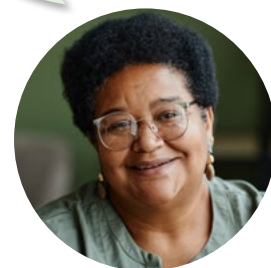
Person living with type 2

I have lost 1 stone and 9 pounds since end of April. . . My blood sugar level has gone down to a prediabetes level. Thanks!